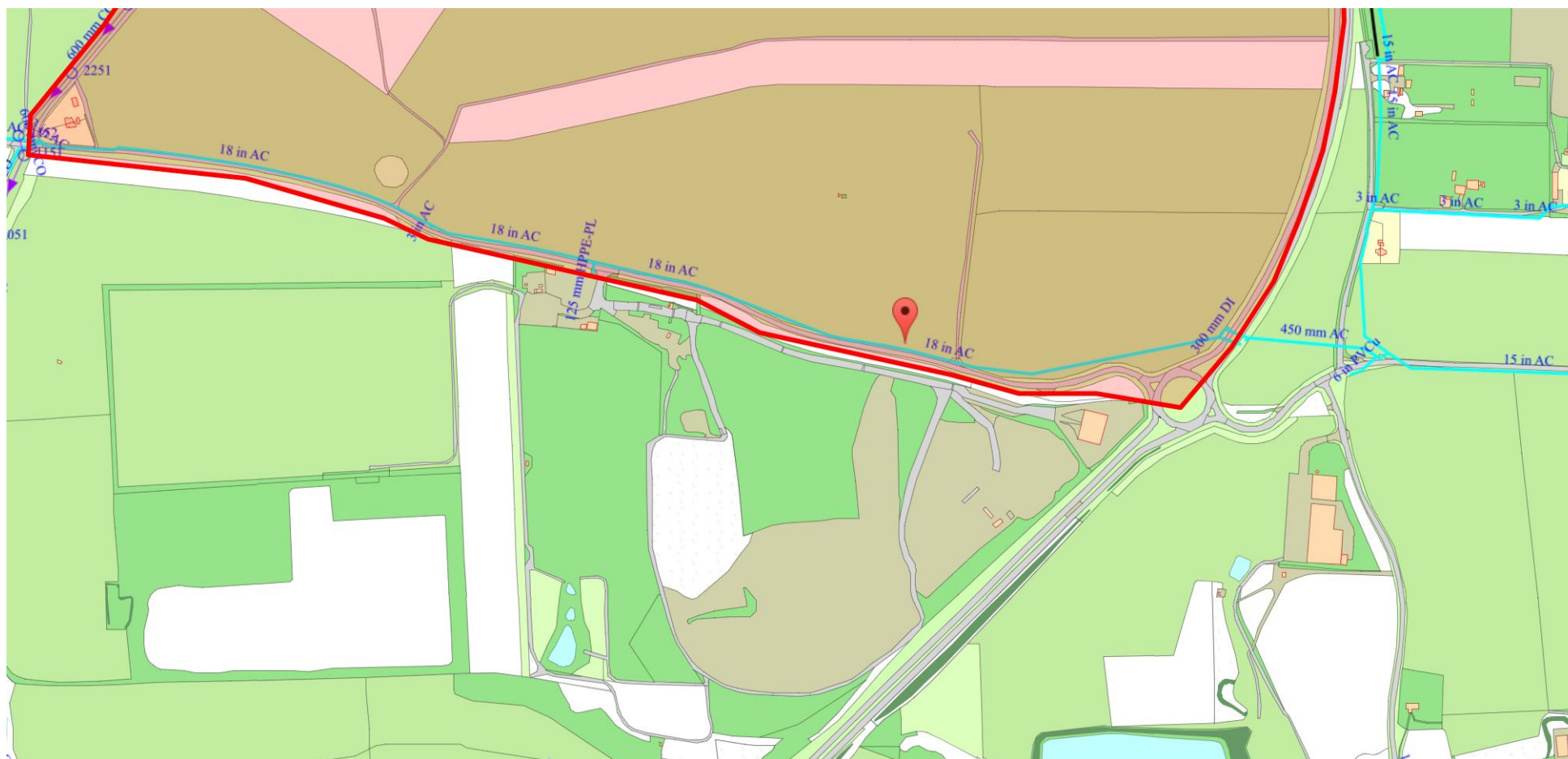
Figure 2: Showing your connection point for potable water supply